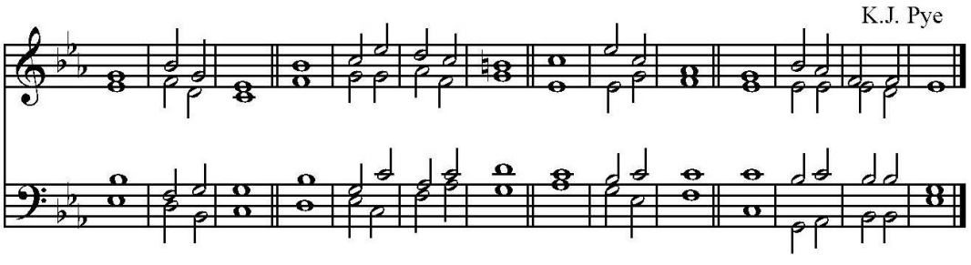
Psalm 24 All are welcome to join in singing the psalm.

<sup>1</sup> I will bless the 'Lord at 'all times; his praise shall 'ever be 'in my 'mouth. <sup>2</sup> I will 'glory · in the 'Lord; let the 'humble 'hear and · re 'joice. <sup>3</sup> Proclaim with me the 'greatness · of the 'Lord; let us ex 'alt his 'name to 'gether. <sup>4</sup> I sought the 'Lord, and he 'answered me and delivered me 'out of 'all my 'terror. <sup>5</sup> Look upon 'him and · be 'radiant, and let not your 'faces ' be a 'shamed.