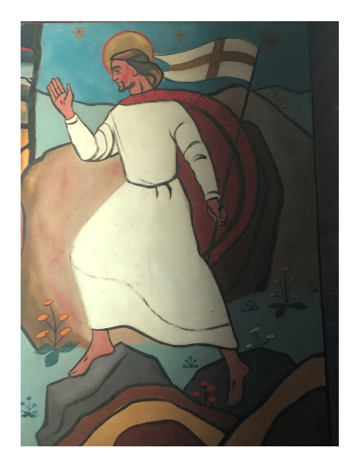
Image from the painting over the children's altar in the north aisle of SPSS.