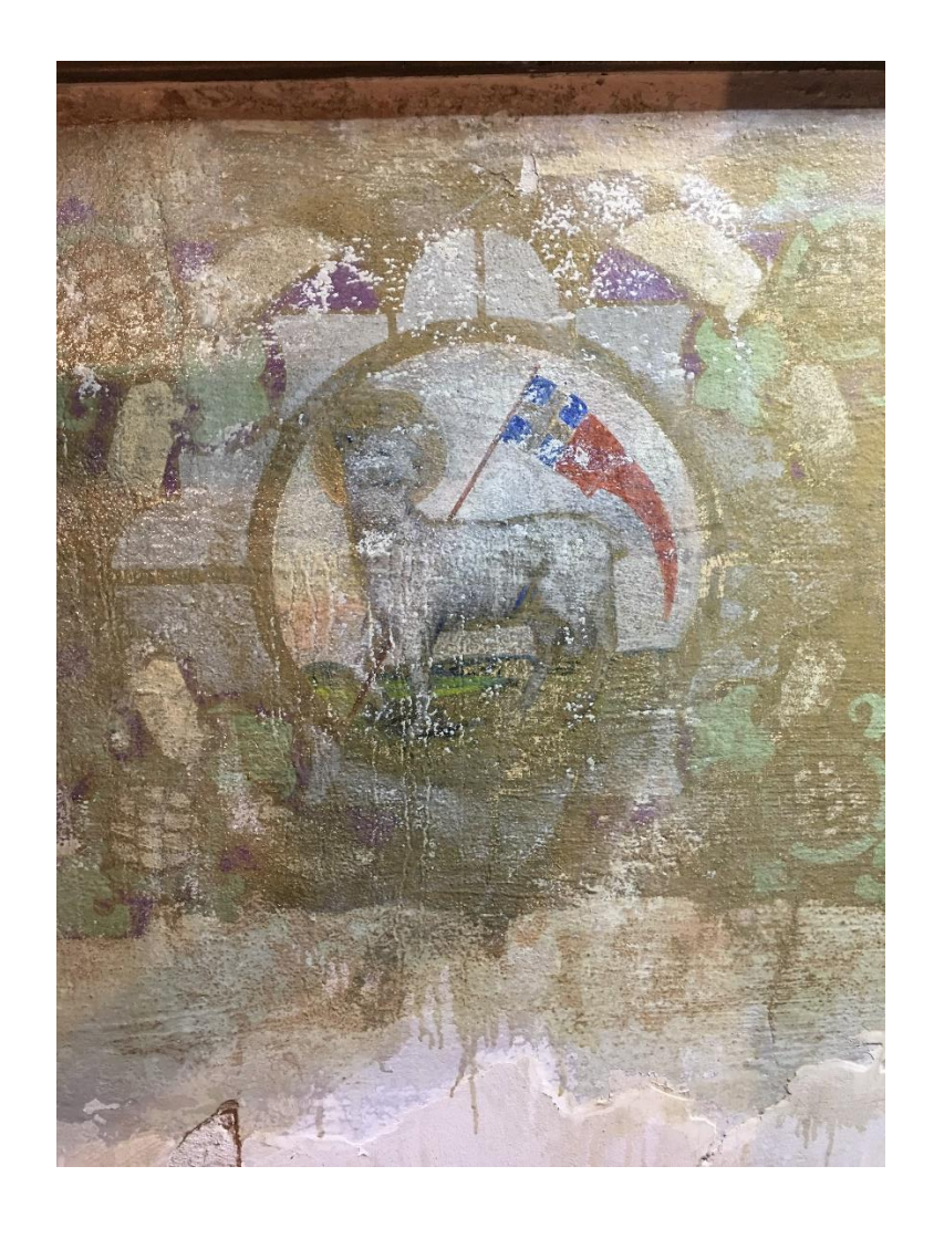
Image of the Paschal Lamb uncovered recently on the north wall of the sanctuary, near the high altar.