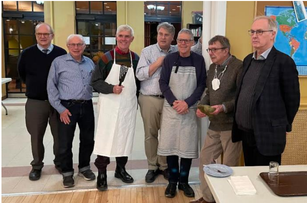
Our gallant cooks and servers!