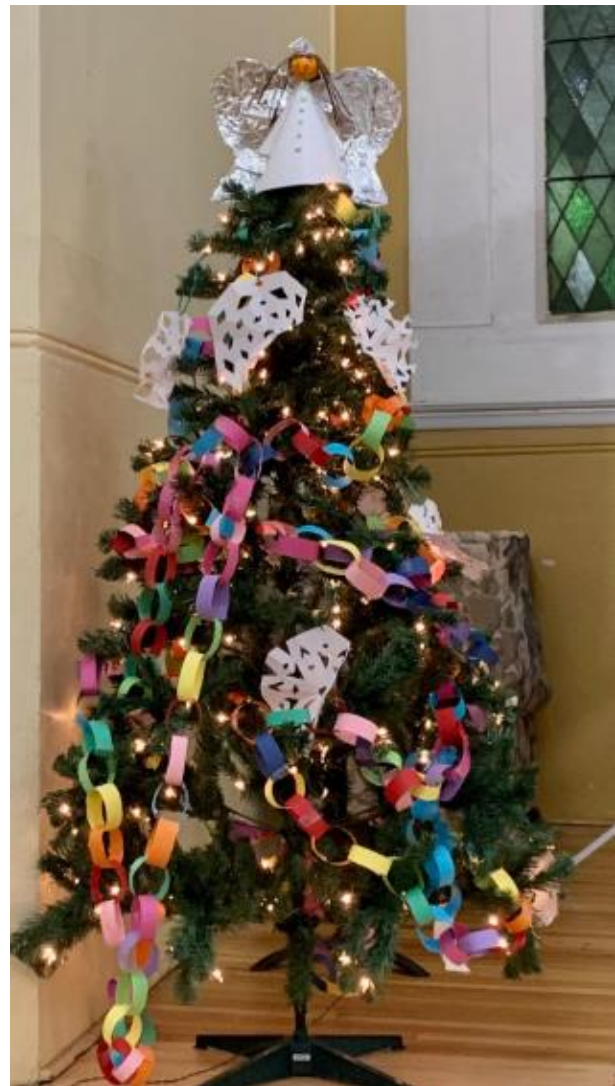
The Homework Club's handmade decorated Christmas tree, 2022!

At present, there are 25 children enrolled in the program coming from the two local St. James Town