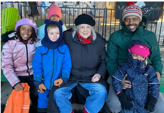
Our parishioners enjoy fun in the cold