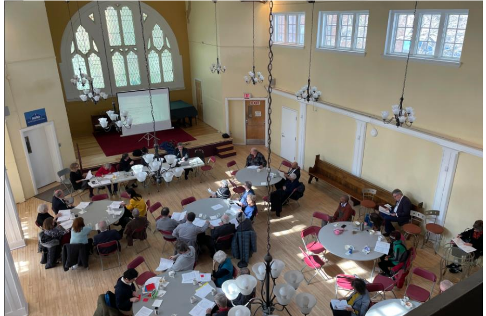
SPSS Vestry 2023.