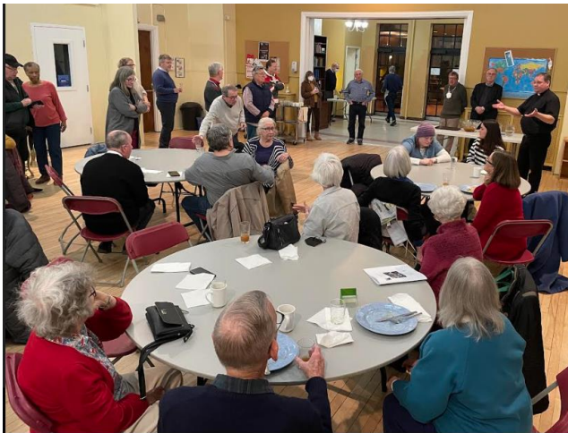
No loaves and fishes miracle needed – there was plenty of delicious food for everyone!