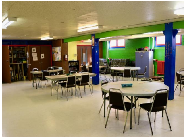
One of the basement classrooms to be renovated for new tenant.

We are looking forward to Spring when the parish will be able to reach out to our surrounding