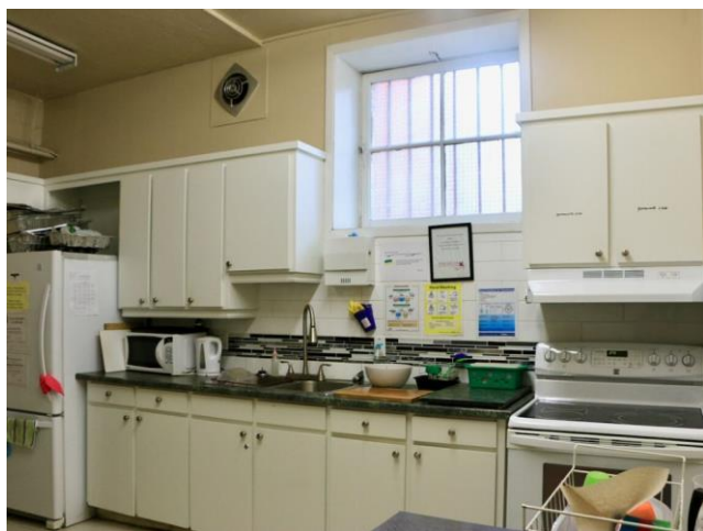
The Basement Kitchen was just one of the rooms the team cleared out.