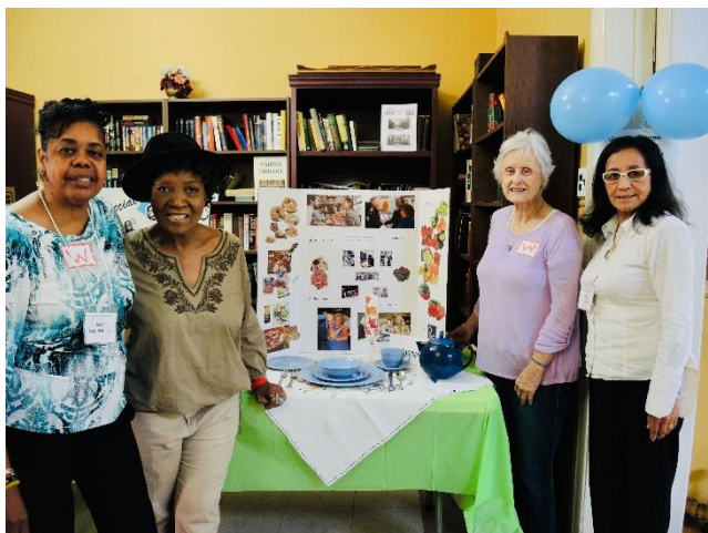
Ministry Fair 2019 Coffee Hour Table SPSS Collection

As we slowly move out of the pandemic, we edge closer to the fellowship of COFFEE HOUR! Board of Health rules state that drinks can be served if partakers are sitting down. In clear weather we may be able to meet on the lawn also. And so, it is time to renew our coffee hour teams. If you are able to join a team of six, either as an old hand or a first try at this volunteer service, please contact the Church office or Fran 416 504 5885. We rejoice as we prepare to reconnect!!