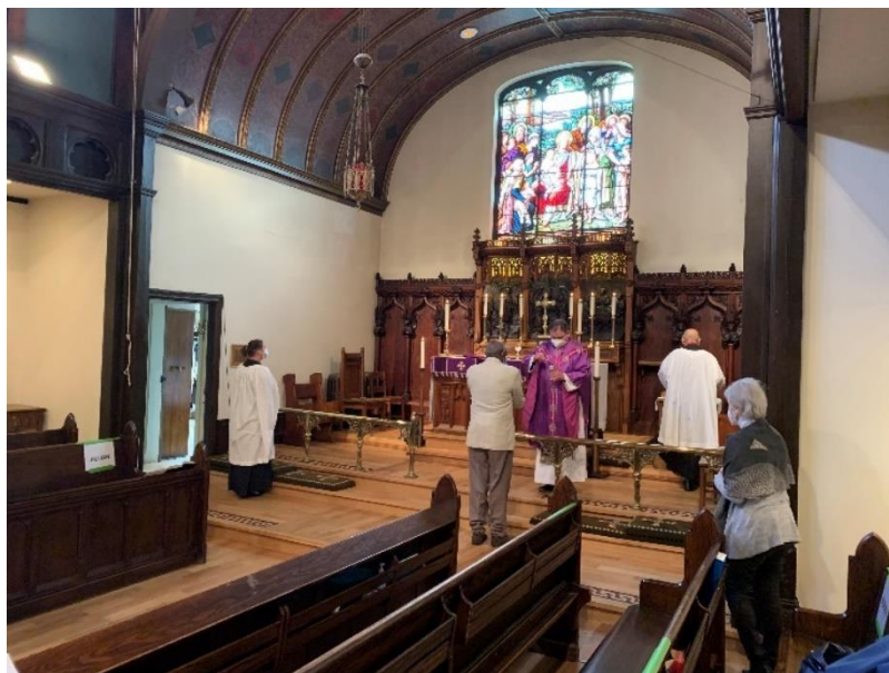
Serving Communion at the new 9:15am Sunday service.