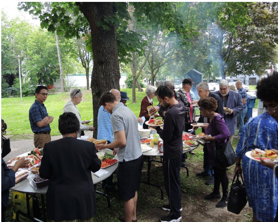
The Parish Festival will have delicious food similar to SPSS 2019 Barbecue's spread

Our church community has been in a long hibernation from regular worship and social activities that, prior to the pandemic, were an important part of who we are. The parish is in need of an infusion of fun and a chance to get together and raise funds for the parish. On June 18th we will have the opportunity to bring our church community together, to reach out to our new neighbours, and longstanding ones, and to celebrate at our first Parish Festival. We will have delicious food, exciting vendors, uplifting music, and creative activities for children on the South Lawn, adjacent to Howard Street. If the weather is inclement, we will be situated in the parish hall.