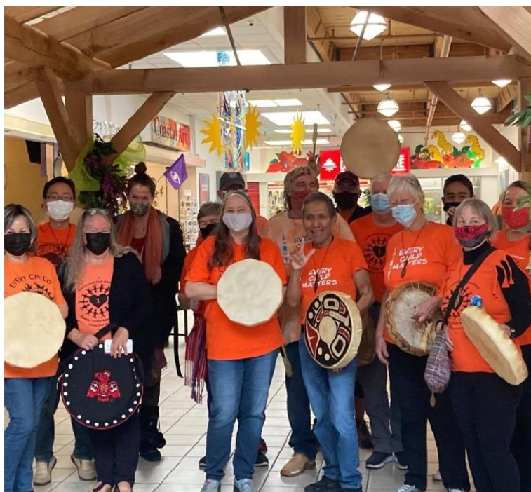
Our drumming circle at a gathering at the Nation

For thousands of years Indigenous people have walked in this land, on their own (unceded) traditional territory. Their relationship with the land is at the centre of their lives. We acknowledge the Coast Salish People of the shíshálh First Nation, past, present, and emerging leaders and their stewardship of this land ( swiya ) throughout the ages.