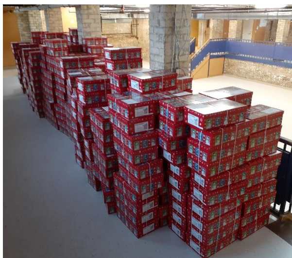
Star Christmas Boxes awaiting pick-up