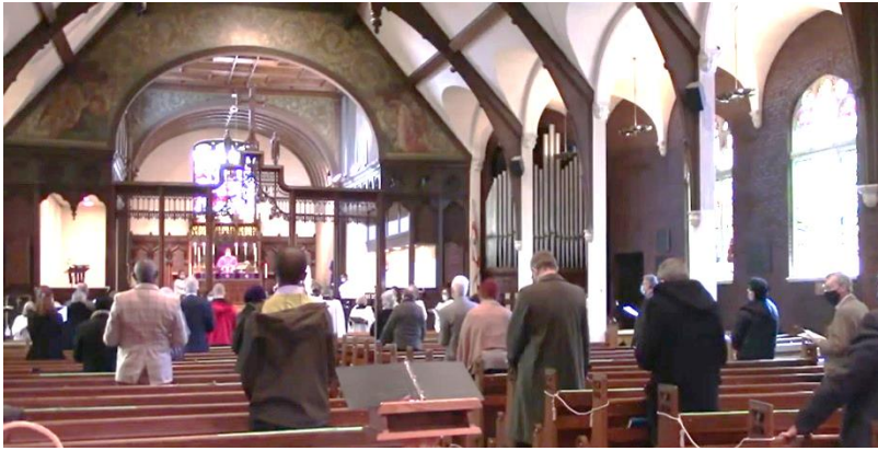
The Fifth Sunday of Lent service attended by people both in-person and on-line.

I remind us of the uncomfortable but very poignant words of the late Archbishop of Canterbury William Temple. "The Church is the only organisation that exists for those who do not belong to it". We have a marvellous parish with so many opportunities to be a sign of God's loving presence in the heart of Toronto. We have good news to share – the good news of Jesus Christ and the grace and mercy he brings. Good news is proclaimed in word, worship and in loving service. Where is God calling us as a community? How is God calling you?