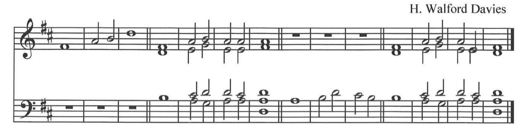
Psalm 125 Sung by all. Please remain seated.

<sup>1</sup> THEY that put their trust in the LORD are even as the 'mount 'Sion, / which may not be removed, but 'standeth 'fast for 'ever.