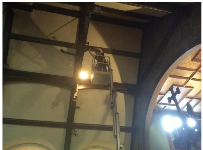
New lighting for the nave

If you wish to bring an idea forward, please feel free to speak with me or drop by a meeting to see what we are doing. The dates and times of Opportunities Committee meetings will appear in the Fridge Notes. All are welcome, and while we cannot implement all ideas, we welcome new voices, thoughts, and experiences to help us grow into a mature parish of active and loving Christians.