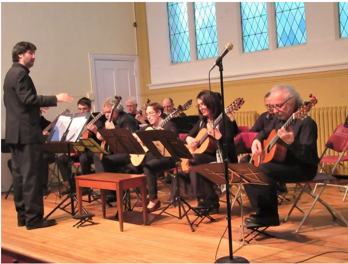
Classical Guitar Society of Toronto In the Parish Hall on April 21, 2018