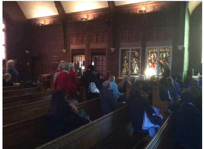
Stain glass window tour April 25, 2018 organized by the ROM

Everyone interested is encouraged to sign up, on the sheet on the bulletin board outside the sanctuary. Alternatively, you can email me at tenjou99@gmail.com to let me know of your interest.