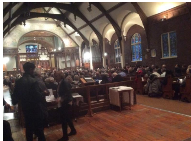
Counter Point Concert Full House on March 24, 2018