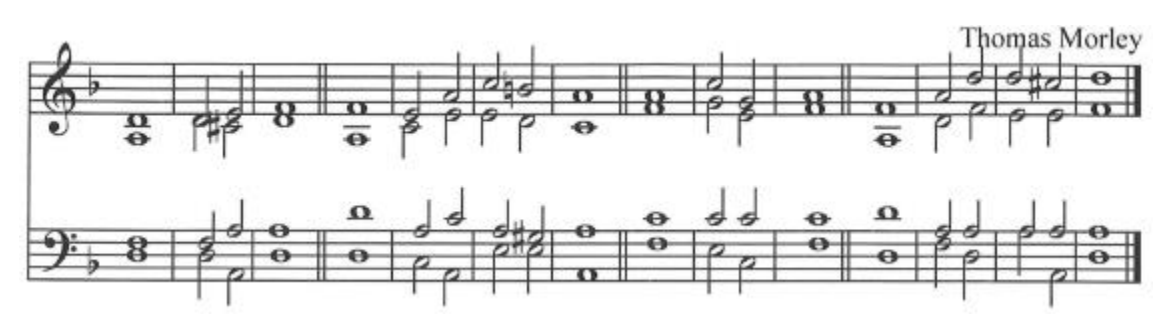
Psalm 50.1–6 Sung by all. Please remain seated.

<sup>1</sup> The Lord, even the Most Mighty ' God, hath ' spoken,