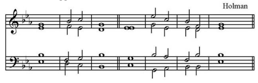
The Venite – BCP pp. 6-7

The Lord God Om' nipotent ' reigneth : / O ' come, ' let us ' worship. O come, let us ' sing unto \cdot the ' Lord: / * let us heartily rejoice in the ' strength of ' our sal'vation. Let us come before his ' presence with ' thanksgiving / * and show ourselves ' glad in ' him with ' psalms. For the Lord is a ' great ' God / * and a great ' King a bove ' all ' gods. In his hand are all the ' corners \cdot of the ' earth / * and the ' strength of \cdot the ' hills is \cdot his ' also. The sea is ' his and \cdot he ' made it / * and his ' hands pre'pared the \cdot dry ' land. O come, let us worship and ' fall ' down / * and ' kneel be fore the ' Lord, our ' Maker. For he is the 'Lord our ' God / * and we are the people of his pasture, ' and the ' sheep of \cdot his ' hand. To-day, O that ye would ' hear his ' voice: / * 'Harden not your hearts as in the Provocation, and as in the day of Temp ' tation ' in the ' wilderness; When your fathers ' tempted ' me, / * proved ' me, and ' saw my ' works. Forty years long was I grieved with that gene ' ration, and ' said, / * "It is a people that do err in their hearts, for they ' have not ' known my ' ways"; Unto whom I ' sware in my ' wrath, / * that they should not ' enter ' into my ' rest.'